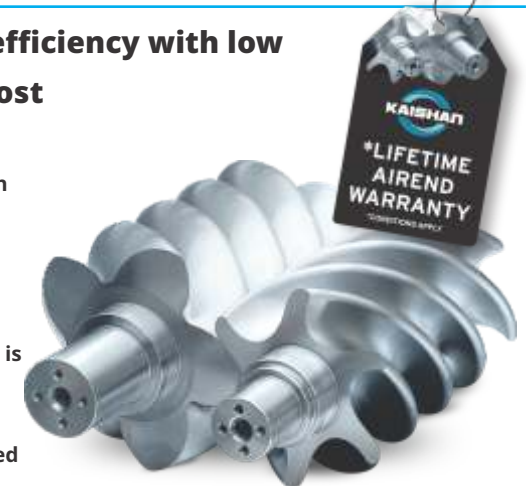
KRSP series 'best in class'

Low cost of ownership throughout life cycle Compressed air is often referred to as the 'fourth utility' and is critical to most manufacturing operations. Facility performance depends upon compressor reliability and efficiency. Power consumption is a significant cost throughout the life of a compressor, therefore it is important to consider the life cycle cost of a compressed air system when evaluating productivity improvements. KRSP series advanced energy saving features reduce operational costs significantly.