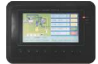
KRSP Series System Management Control Panel

The control panel contains a special programmed microprocessor that can safely and efficiently control all the functions of the compressor. The touch screen display monitors line pressure, oil temperature and working conditions (running, idling and stop) Abnormal conditions will trigger a flashing LED and a flashing message indicating the cause of the alarm. Microprocessor functions are password protected, accessible only to the authorised personnel.