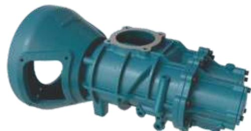
KRSP Series patented air end