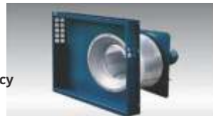
VSD cooling fan provides energy savings by reducing airflow during periods of light load or low temperatures.