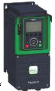
KRSP Series Variable Speed Drive

The drive provides a soft start and the ability to operate efficiently through the compressor's capacity range by matching flow to demand while maintaining a high level of pressure control. By eliminating wasted energy, cost savings as high as 50% or more are possible. With this level of savings, the additional capital cost of the variable speed drive can be recovered in less than one years operation.