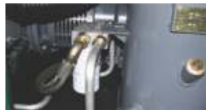
Lubricant filter assembly features a spin-on,